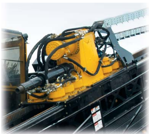
50,000 ft/lbs of torque High torque for drilling in difficult ground formations and turning large back reamers.